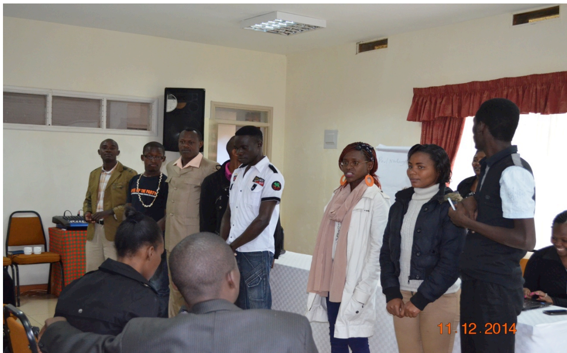
The Alumni Leadership after the election.